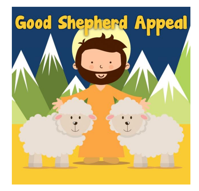
2 - Father Hudson's Care - your child has been provided with a white plastic envelope to fill up with coins donated by relatives and friends to raise money for Father Hudson's Care, who are supporting the vulnerable and those in need across the Archdiocese of Birmingham.

If each child in school could attempt to raise at least £1 that would be wonderful. Thank you all for your generosity and support towards out Lenten charity.