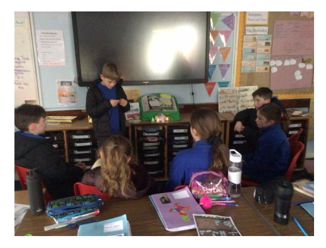
1 - Our Caritas ambassadors reading prayers from the prayer stop in school. During the Year of Prayer we are all encouraged to spend time alone with God.