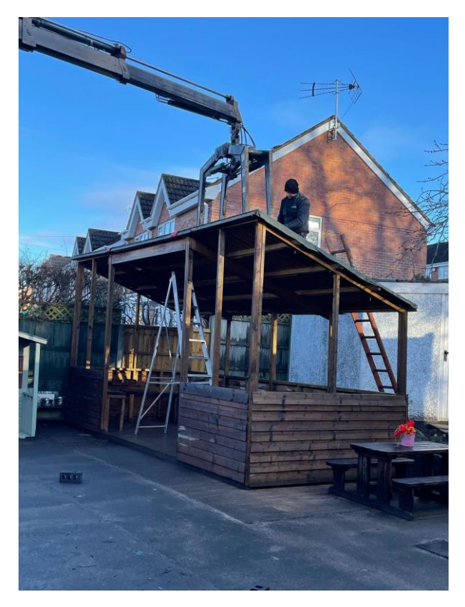
5 - Thank you to the PTA for purchasing the new outdoor classroom in our Reception outdoor area. The children absolutely love using it!