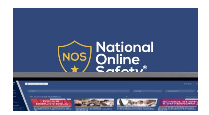
6 - National Online Safety

Please do sign up to this fantastic resource which we also use regularly in school. All schools within Emmaus have been provided with this opportunity to support online safety of our children. I have resent the sign up letter to all parents today.